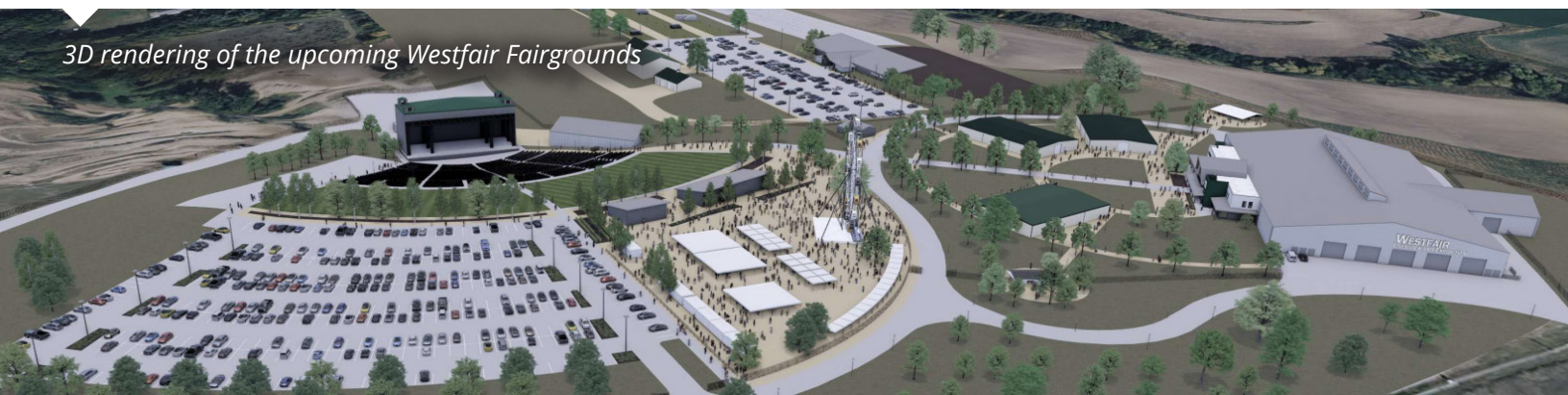
3D rendering of the upcoming Westfair Fairgrounds

Read our full press release at bit.ly/IWFCycle3 .